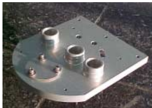
Ports on the bottom of the base-plate

The weighing mechanism is mounted on a ½ inch thick anodized Aluminum base plate which is covered by a Stainless Steel dome. Below the base plate are ports for the sample and tare tubes. The baseplate is milled from a nearly two inch thick block to eliminate any welds and possible vacuum leaks. All internal parts are anodized, gold plated or Teflon coated to resist corrosion and reduce out-gassing.